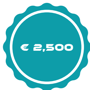
Table top (Approx. 3M table top exhibition stands, including 1 complimentary exhibition pass)

Shell Scheme (3X3M, including complimentary registration for 1 delegate)